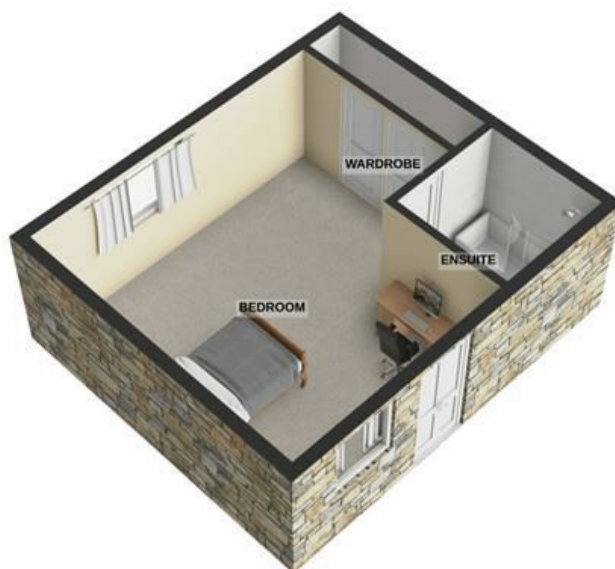
TOTAL FLOOR AREA : 536 sq.ft. (49.8 sq.m.) approx.

For illustrative purposes only. Decorative finishes, fixtures, fittings and furnishings do not represent the current state of the property. Measurements are approximate. Not to scale. Made with Metropix © 2024