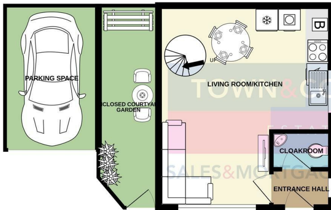
GROUND FLOOR 268 sq.ft. (24.9 sq.m.) approx.